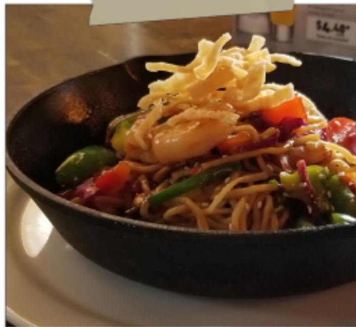
Shrimp Ramen Stirfry