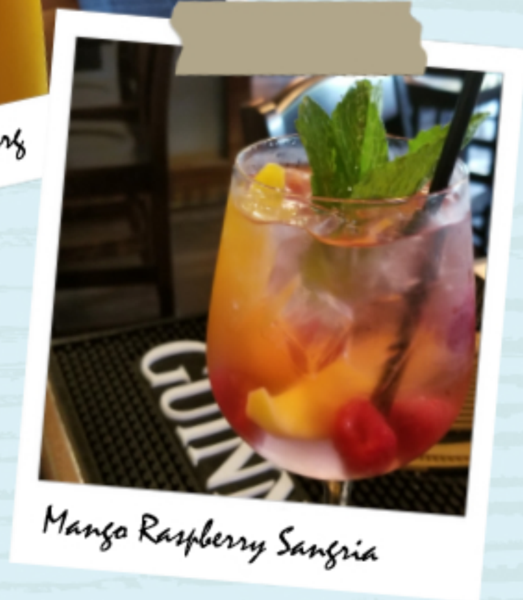
Mango Raspberry Sangria