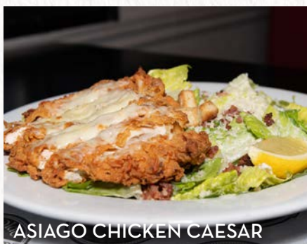
ASIAGO CHICKEN CAESAR