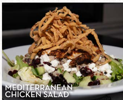
MEDITERRANEAN CHICKEN SALAD