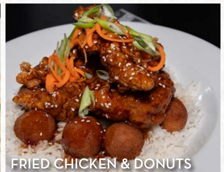
FRIED CHICKEN & DONUTS

gfo Gluten friendly option available. vo Vegetarian option available. v Vegetarian.