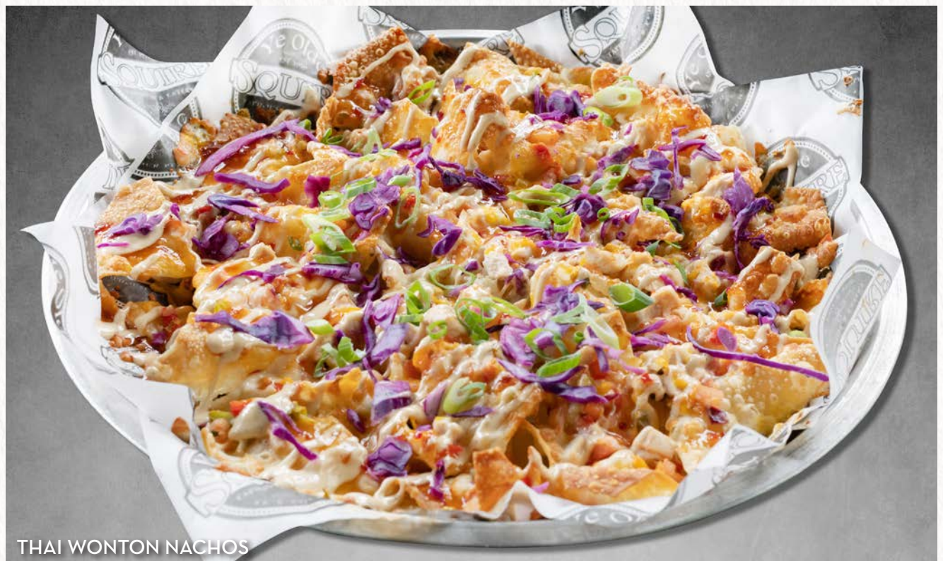
THAI WONTON NACHOS

Crispy battered cauliflower / black bean and sweet corn pico de gallo / coleslaw / purple cabbage / roasted garlic aioli 18.99 / Add guacamole +3.99 / Add your choice of wing sauce to bites +1.00.