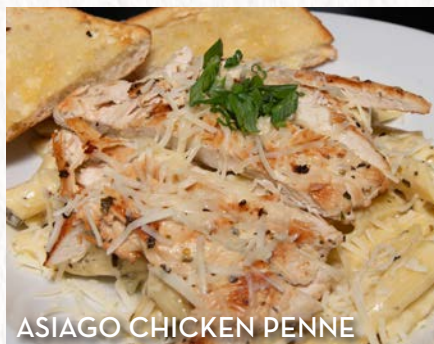
ASIAGO CHICKEN PENNE