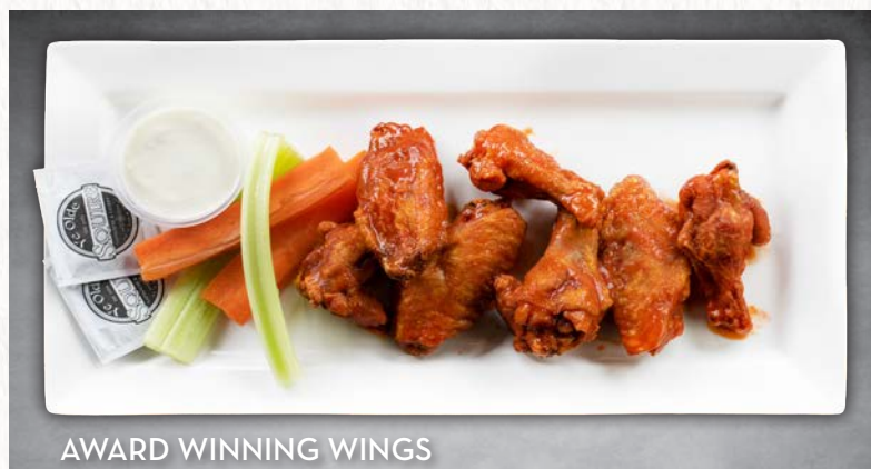
AWARD WINNING WINGS

Disclaimer... As a service to our wonderful guests, we do our best to offer gluten friendly versions of many of our dishes. Please be advised that all items are prepared in a common kitchen in which other gluten-containing items are also prepared. As a result, we cannot recommend this for persons with Celiac Disease. Our gluten friendly offerings are designed for those with minor gluten sensitivities or those who prefer to avoid gluten for nutritional reasons.