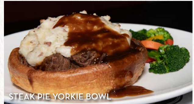
STEAK PIE YORKIE BOWL

Crispy beer battered Atlantic haddock / scallops / shrimp / fresh cut fries / onion rings / slaw / tartar / seafood sauce / lemon wedge 26.99 Add shrimp skewer +6.99