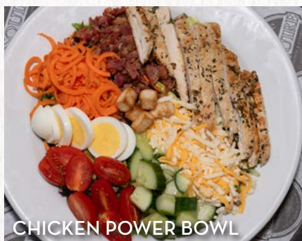
CHICKEN POWER BOWL

Romaine / bacon / croutons / breaded Asiago crusted chicken breast 22.99